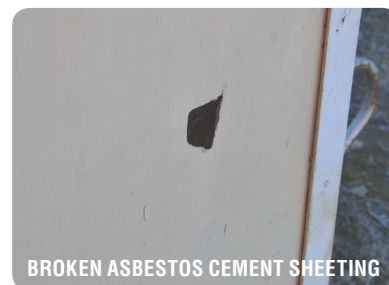
BROKEN ASBESTOS CEMENT SHEETING