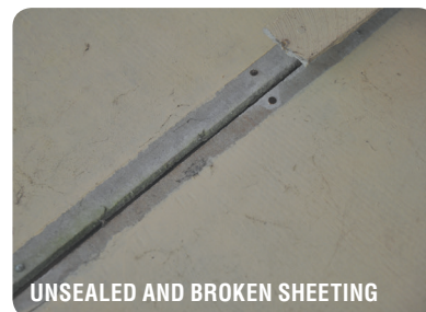
UNSEALED AND BROKEN SHEETING