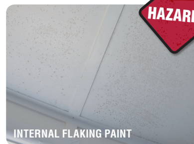
INTERNAL FLAKING PAINT