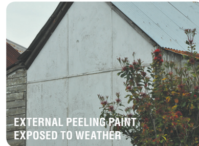
EXTERNAL PEELING PAINT EXPOSED TO WEATHER