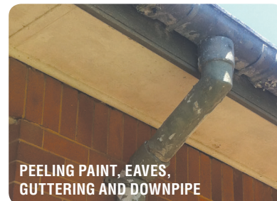
PEELING PAINT, EAVES, GUTTERING AND DOWNPIPE